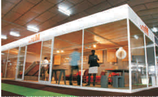
"ECOMOVEL Stand in the 2013 Yecla's Furniture Fair"