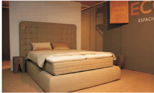
Eco Mattress produced by ECUS